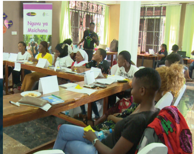
Transformative Leadership Training session in Tabora