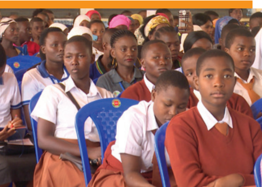
Ajenda ya Msichana 2019 PARTICIPANTS