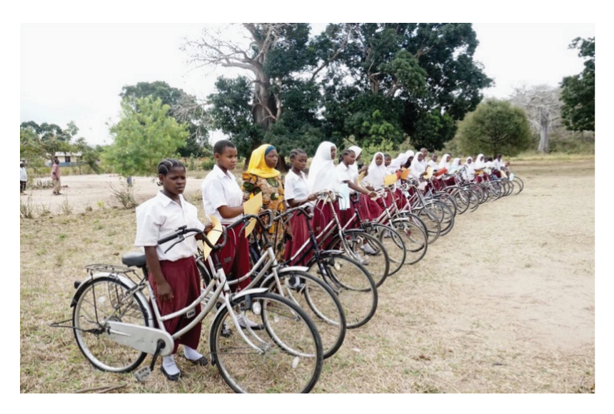
25 Students from 1&2 from Nangaru Secondary School in Lindi

One girl one biye is a donation initiative which supports young girls who walks long distance to school, arrives late and most of the time are physically exhausted, which affect their ability to learn. They live far from school and walk 2 to 3 hours. The situation puts girls at a high risk of sexual harassment, pregnancies and early marriages causing them poor academic performance and/or forcing them to drop out of school.